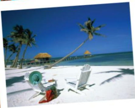
Victoria House beach

The Spanish were first to arrive in Belize in the 1500s, followed by the British settlers in the early 1600s. The 1600s and 1700s were marked by conflict between the Spanish and British over the rights to the rich and tropical islands of Belize. In 1798, the British defeated Spain in the Battle of St. George's Caye, a victory that is still celebrated every September 10 because it cleared the way for the British settlers to