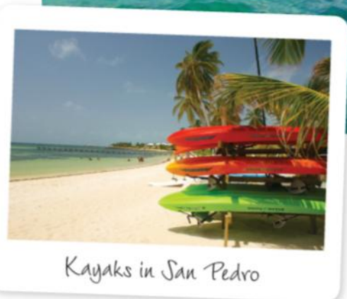
Kayaks in San Pedro

in the northern-most waters of the country, three-quarters of a mile west of the Belize Barrier Reef and is