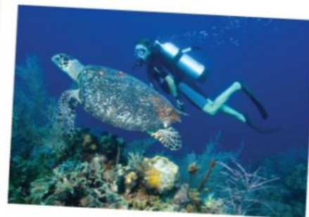
Diver with Hawksbill Sea Turtle